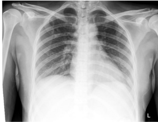
Figure 1. Normal anteroposterior chest radiograph