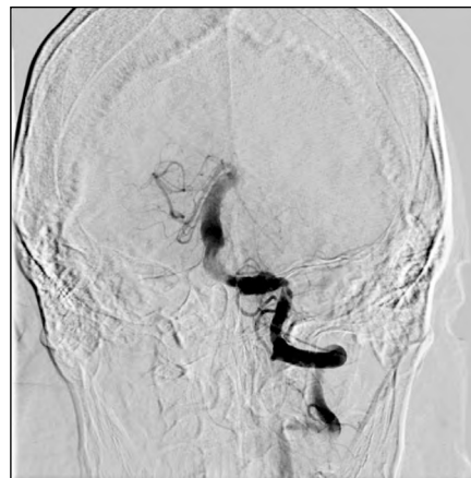
FIGURE 2. Cerebral angiography: left VA, V4 segment, a concentric focal stenosis of 70%, followed by an extensive fusiform aneurysmal dilation, extended until the bifurcation of the BA

The cerebral angiography (Figure 2) revealed in the V4 segment of the left vertebral artery (VA) a focal, concentric stenosis of 70%, followed by a fusiform dilation extended to the BA bifurcation. The angiography also revealed a tortuous trajectory of the abdominal and thoracic aorta, including the supra-aortic vessels and a saccular aneurysmal dilation in the communicant segment of the internal carotid artery.